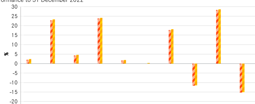
Historic performance to 31 December 2022

As of 31 December 2014, the Benchmark Index converted from a close of business valuation to a midday valuation. Historic performance of the Benchmark has been simulated by the Benchmark provider and such data is used for the purposes of demonstrating historic performance in the "Past Performance" table from 31 July 2009 or from the launch of the share class if later.